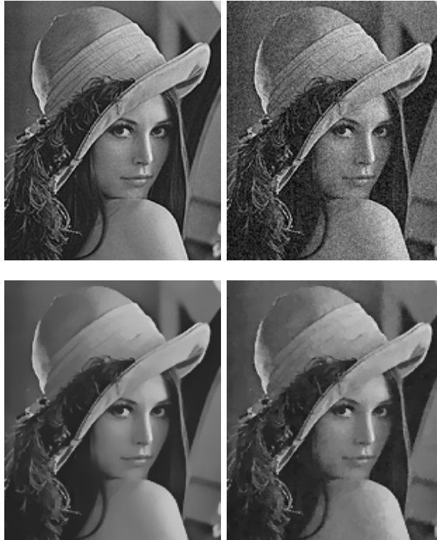
Figure 2: Top: an image, original and noisy. Bottom: the corresponding TV-regularized image (same \lambda ). Observe that the staircasing is hardly visible on the regularized version of the original image, which is “closer” to BV than the noisy version.

of discontinuities, in particular, by a progressive merging of the flat areas). See Figures 1, 2 for numerical experiments illustrating these comments.