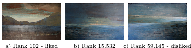
Figure 2: Key paintings with high global confidence